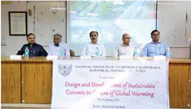
Inauguration ceremony of Workshop on Design and Development of Sustainable Concrete in the Era of Global Warming (Jan 2017)