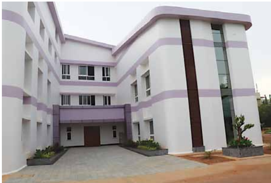
New Building for Library