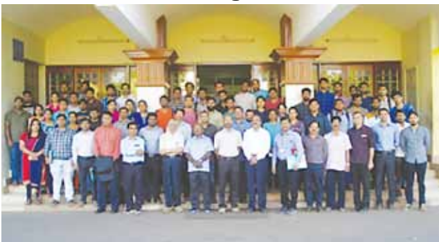
TEQIP II sponsored two days' workshop on "Materials for Biomedical and Specialty Applications" on 23 rd -24 th January, 2017