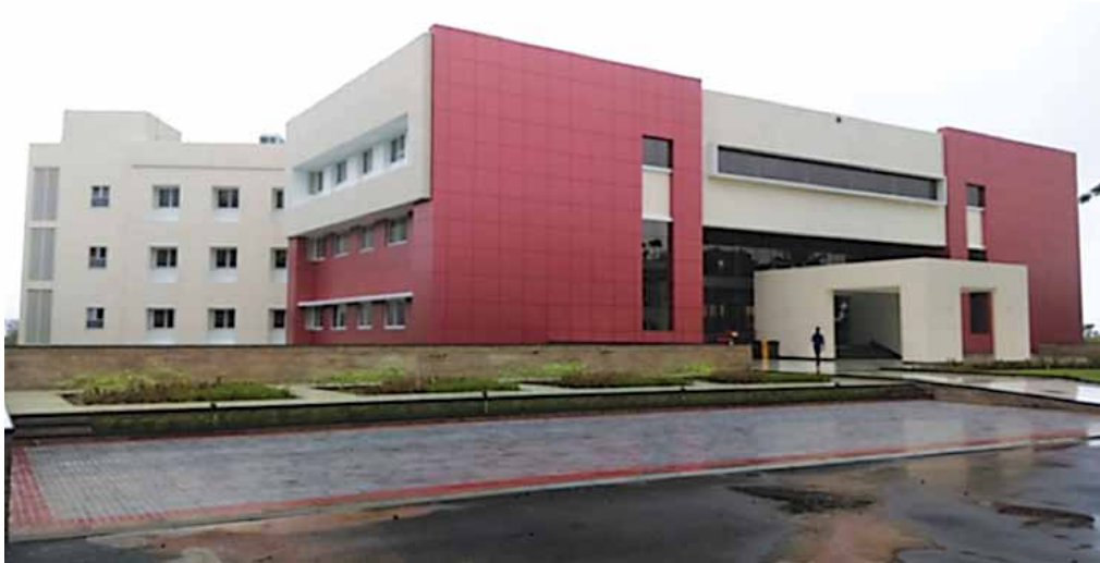
New building for the Department of Computer Science & Engineering