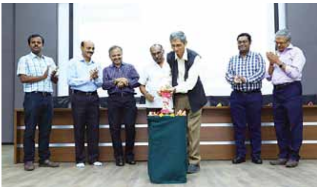
Workshop on Past, present and future scenarion in Marine Structures