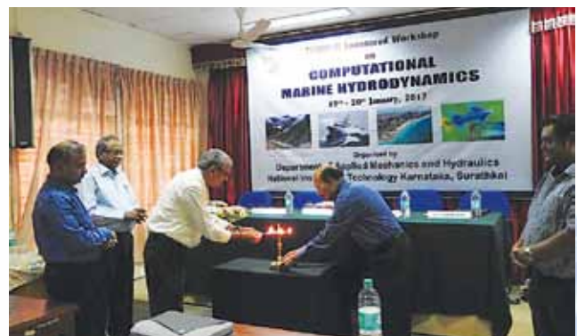
Workshop on Computational marine Hydrodynamics