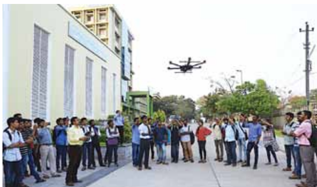
Workshop on Prakriti Infocus