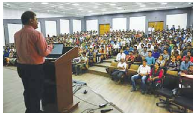
Workshop on Prakriti Infocus